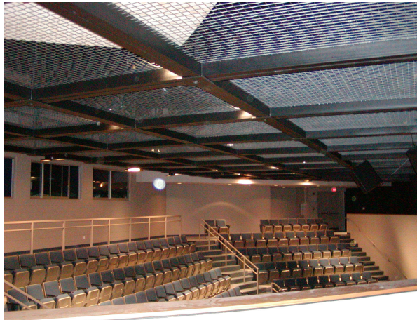
Tension grid over performing area